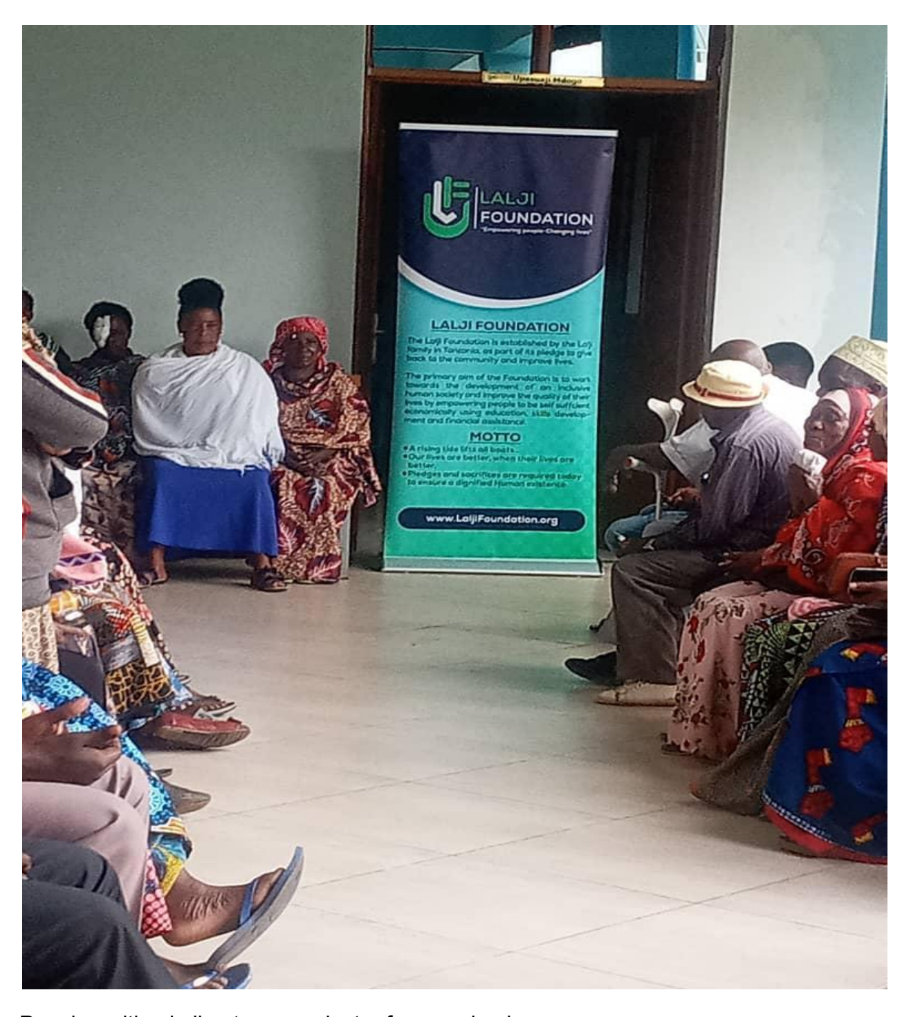
People waiting in line to see a doctor for eye check-ups.