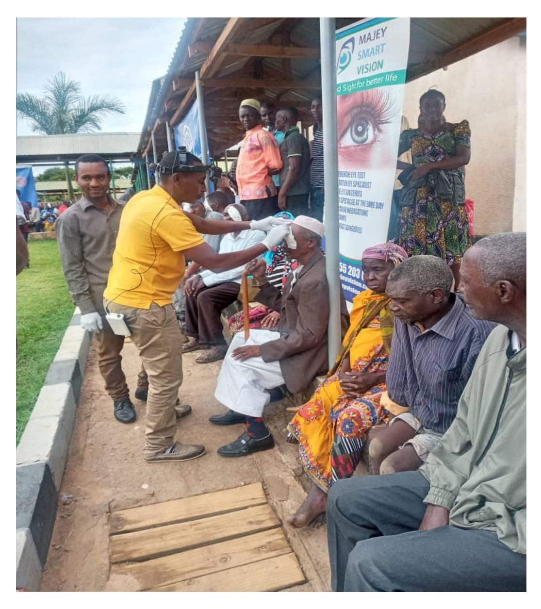
Doctor's instructions on how to put medicine in the eyes.