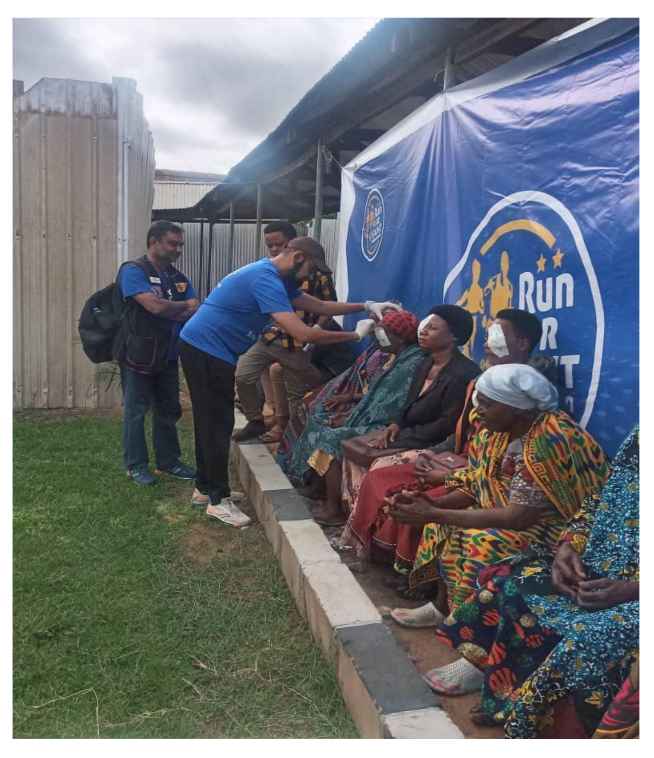
People who have undergone eye surgery are being bandaged and given eye medicine.