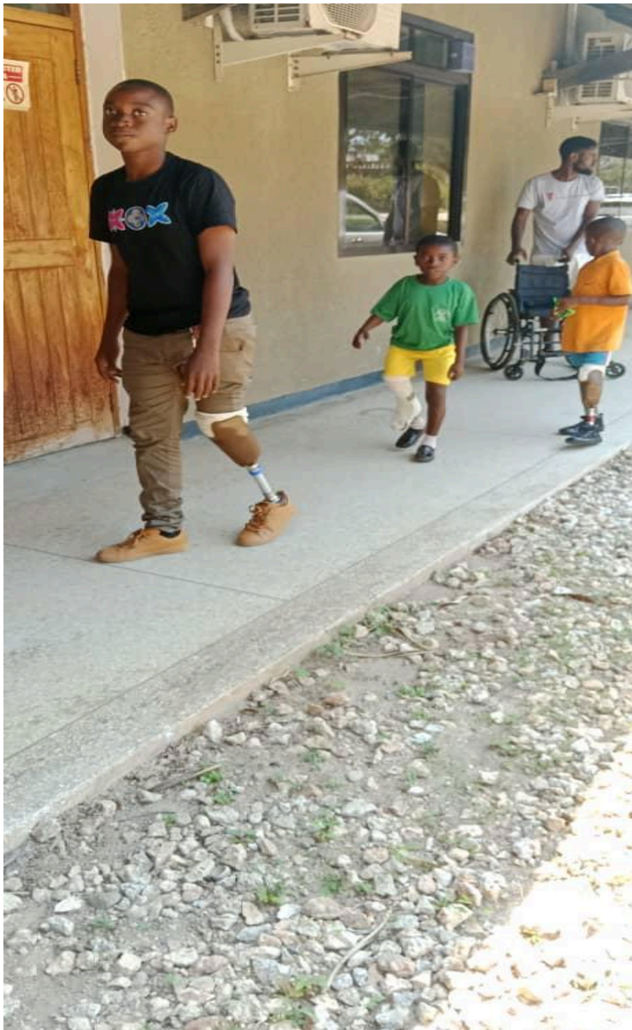
The children were being fitted before they got prosthetic legs.