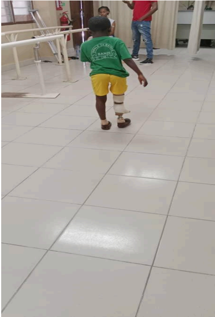
The child was being fitted with exercises before he was given a prosthetic leg