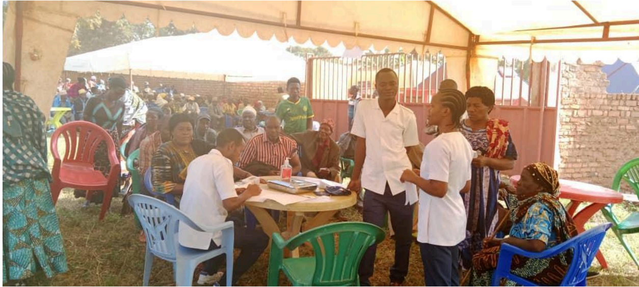
Kasulu Medical Camp Registration