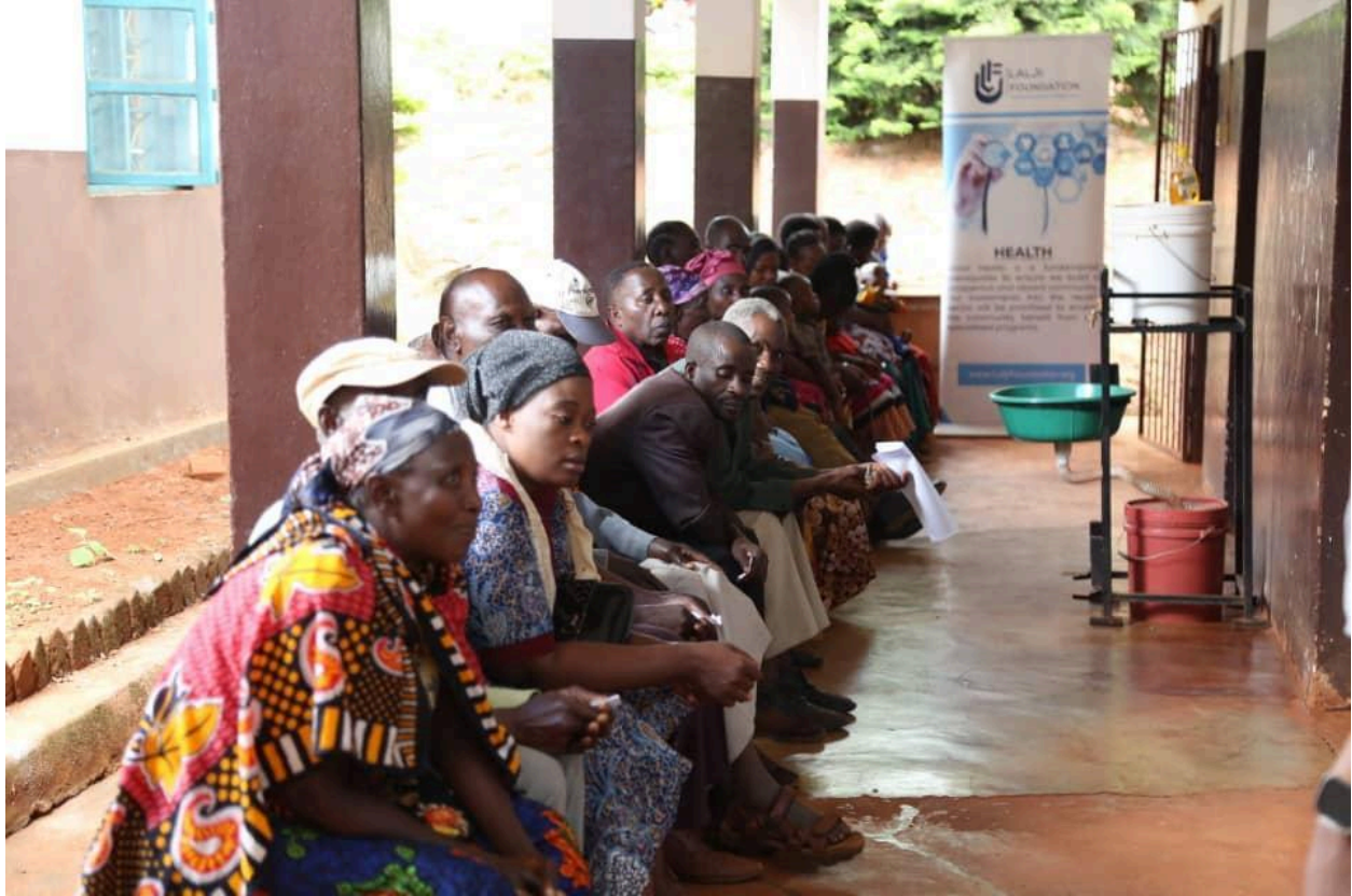
People waiting to receive treatment