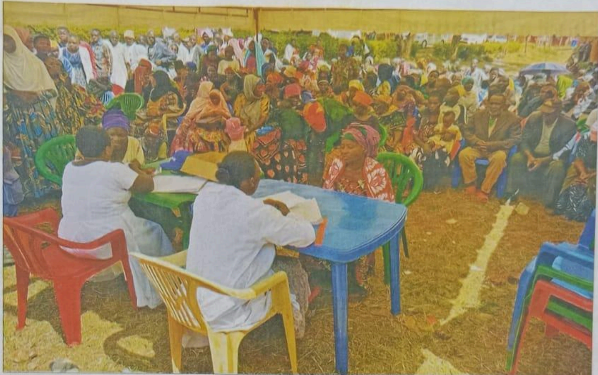
Kasulu District residents pictured at the weekend registering for medical attention at a five-day camp that has attracted specialist doctors from Kigoma Maweni Regional Referral Hospital.