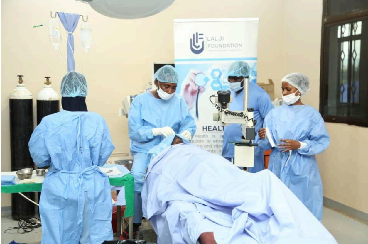
Cataract surgery room