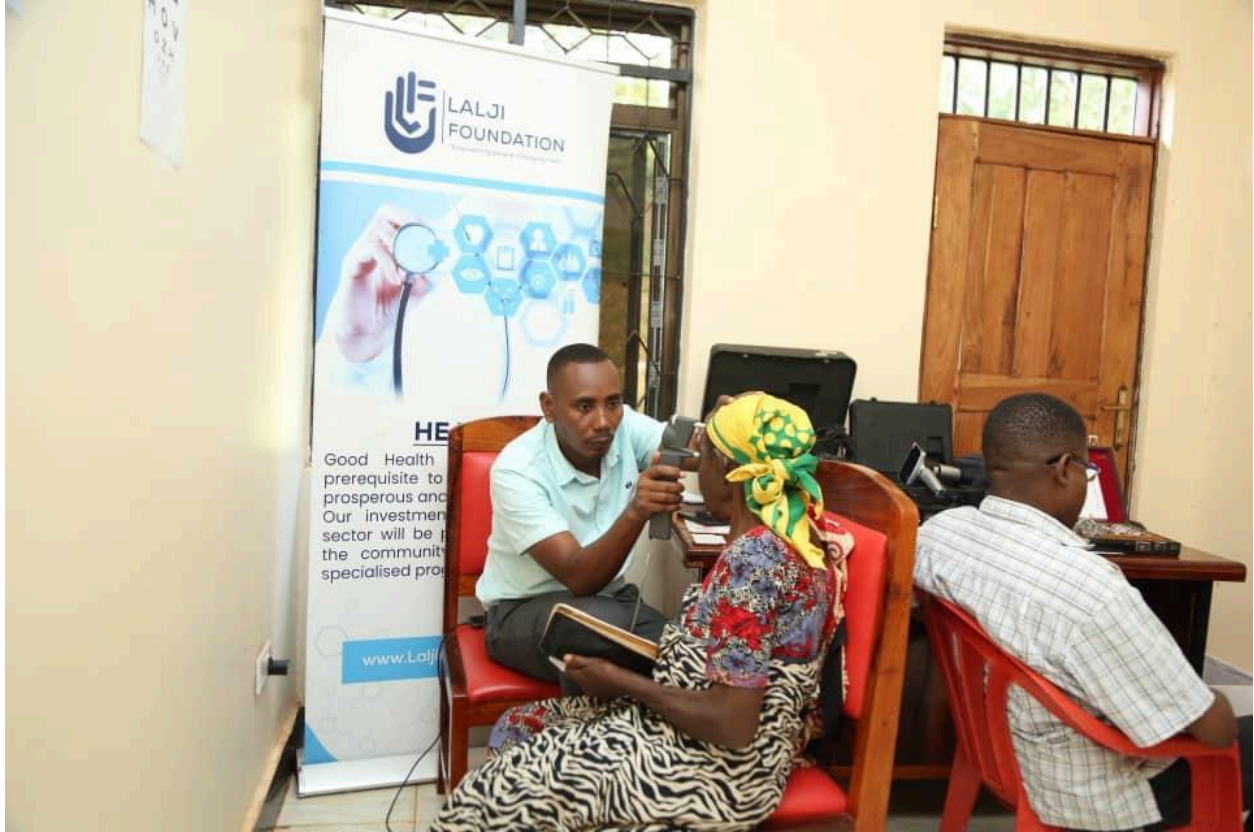
The doctor examining the eye