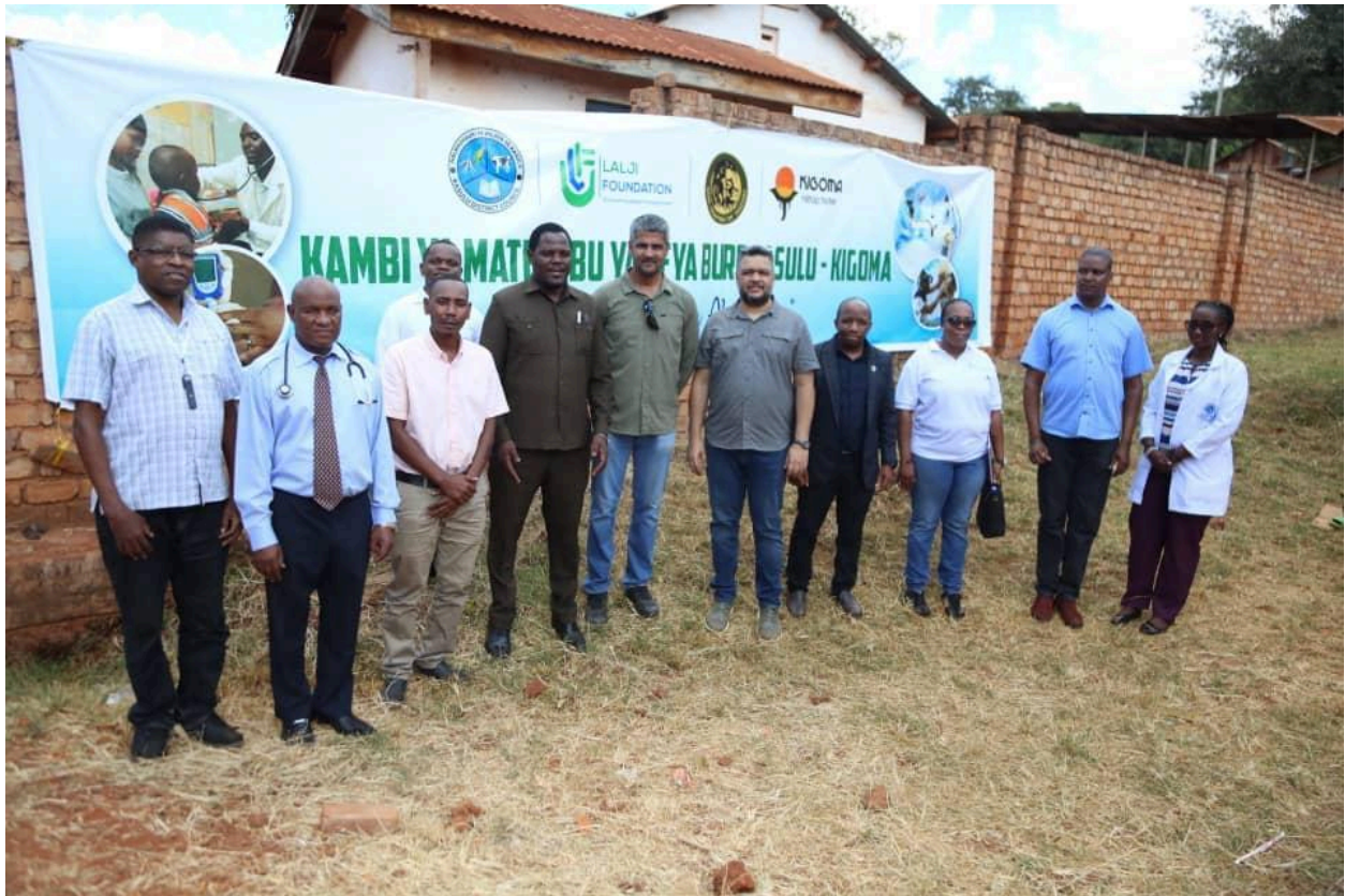
Director of Kasulu District Council, specialists together with sponsors