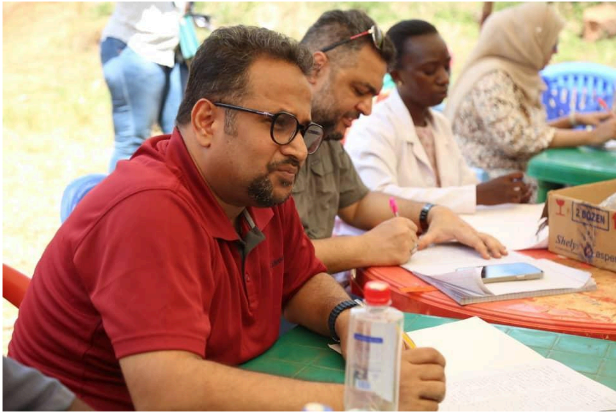
Registration on Health Medical Camp Kigoma-kasulu