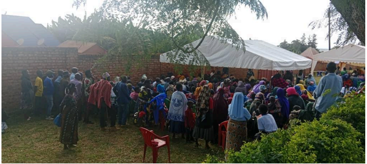
Health medical camp registration