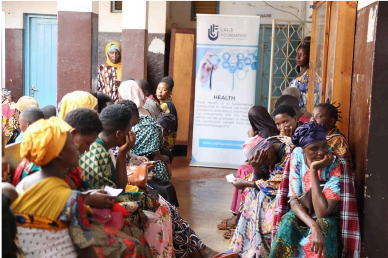
People waiting to receive treatment