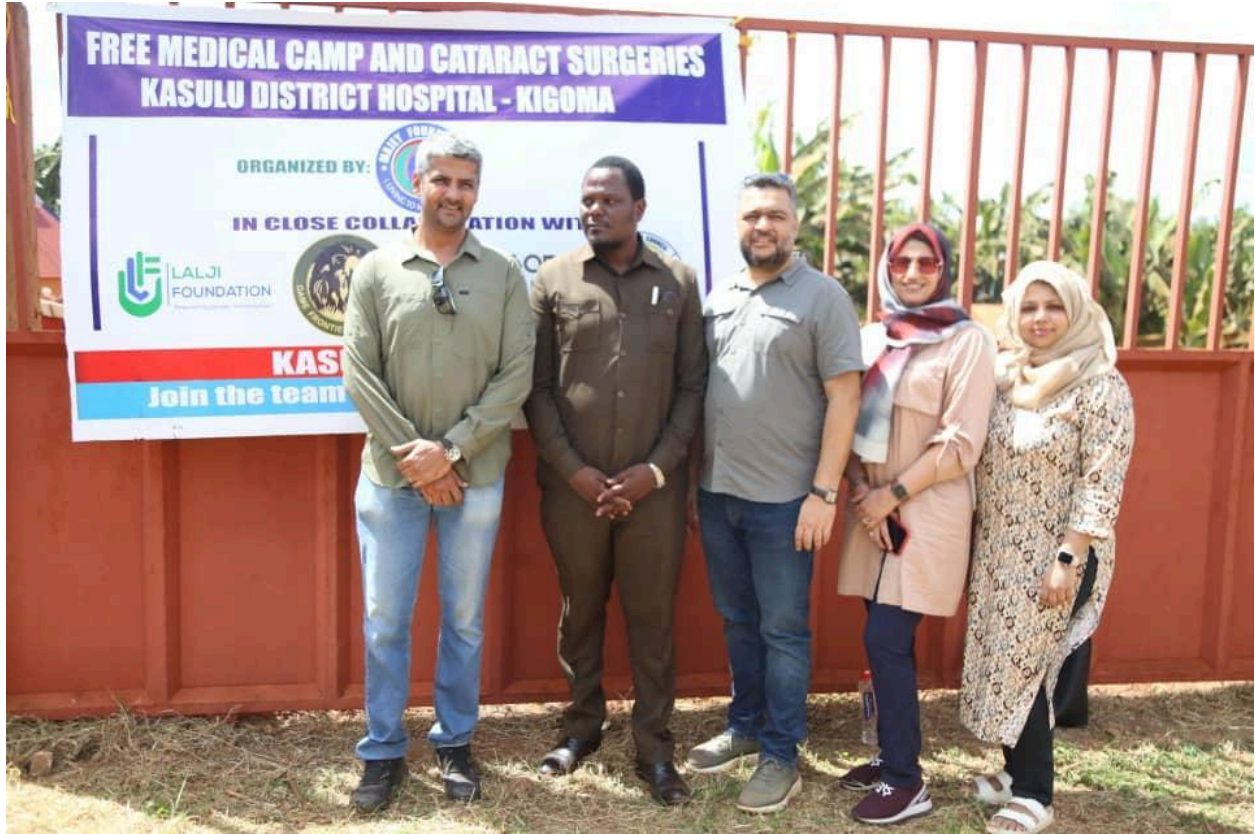
Lalji Foundation and Game Frontiers members together with the Director of Kasulu District Council