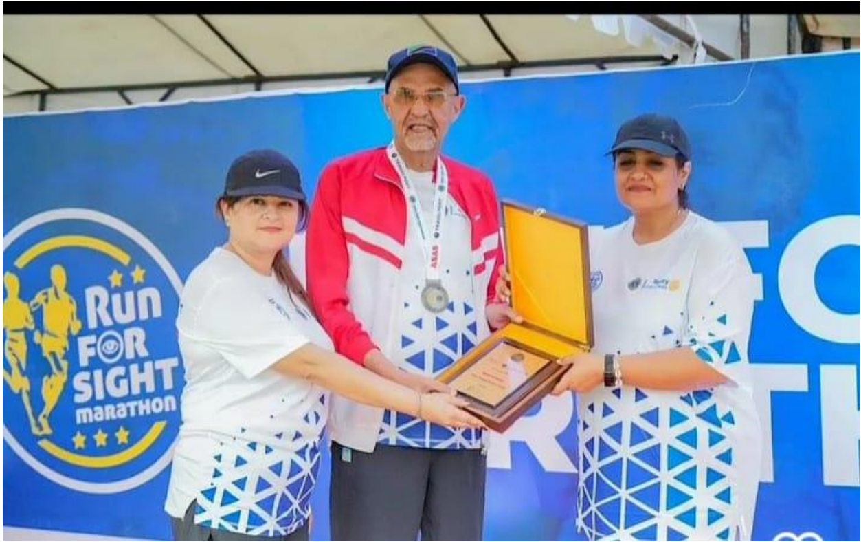
Deputy speaker of the National Assembly of Tanzania Mussa Azzan Zungu in the middle together with Lions Clubs International and Rotary Clubs