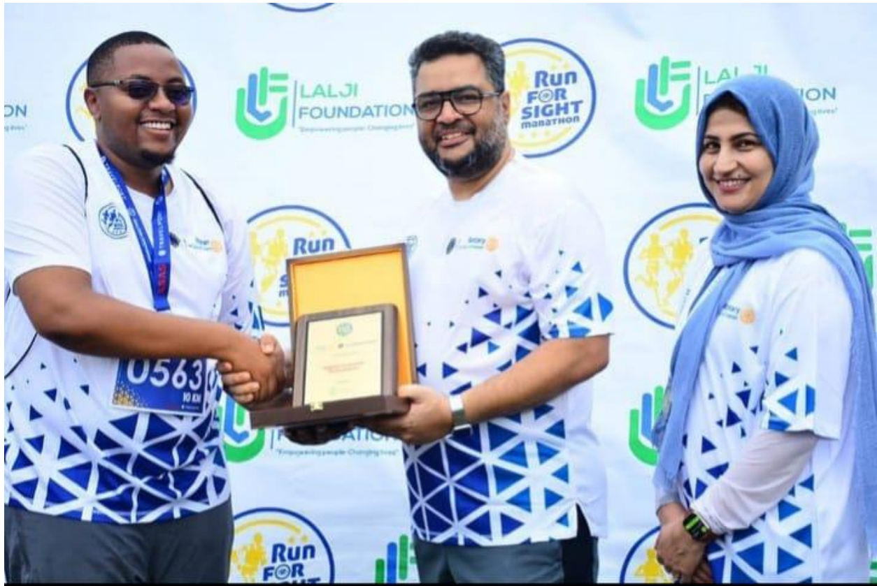
Lalji Foundation together with one of the members who participate in the run sight marathon