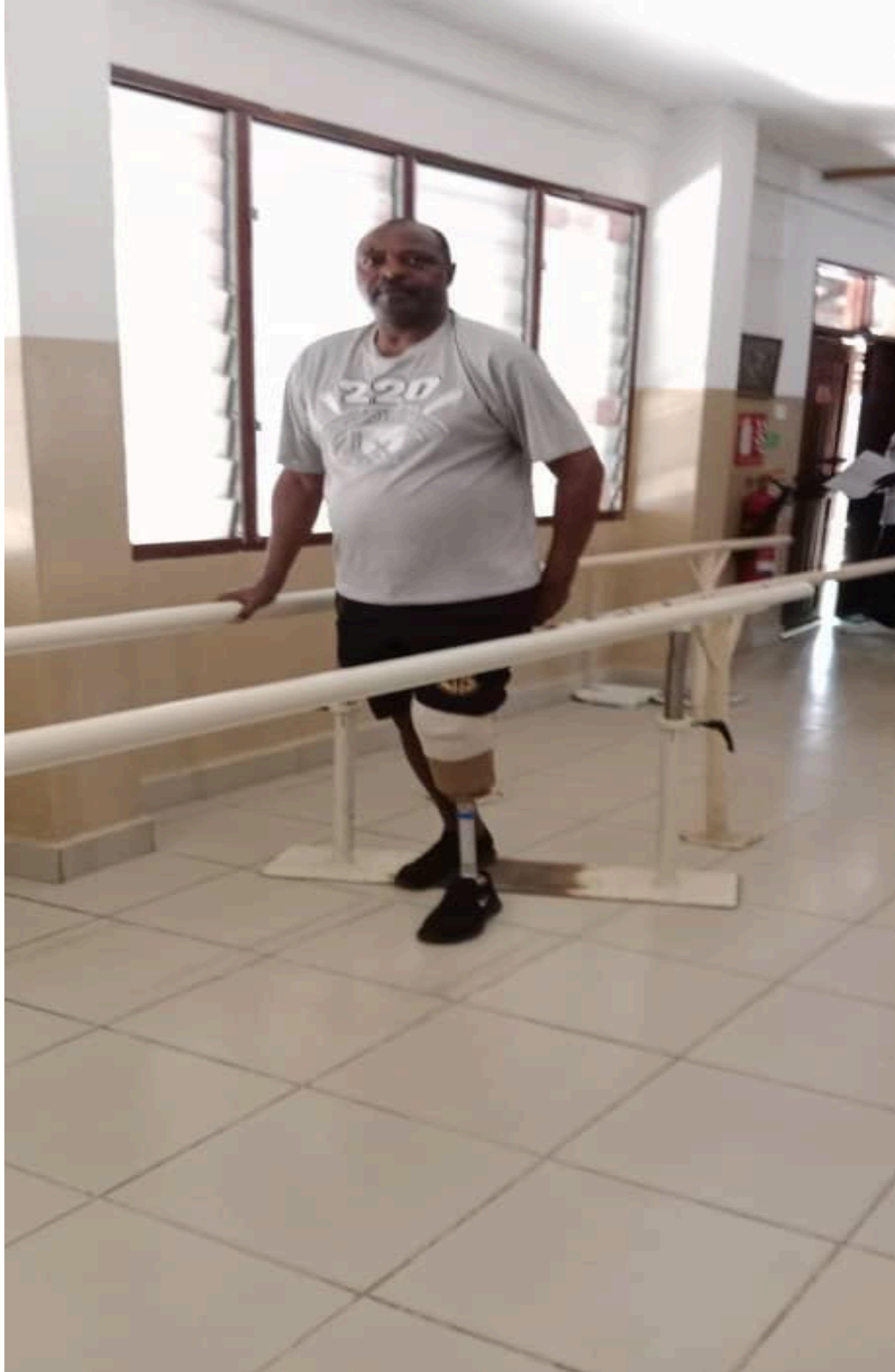
One of the patients was fitted before getting a prosthetic leg.