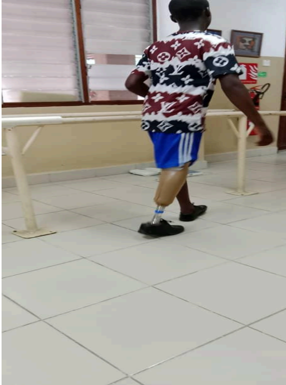
The child was being fitted before they got prosthetic legs.