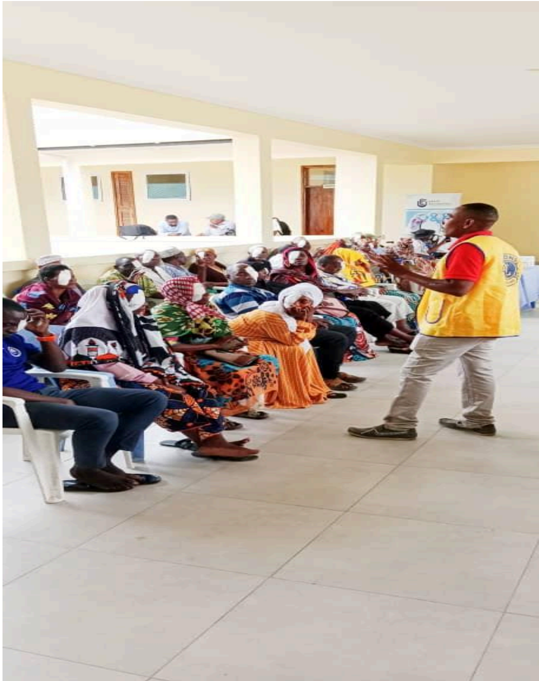
The doctor make awareness on how to protect the eye after surgery.