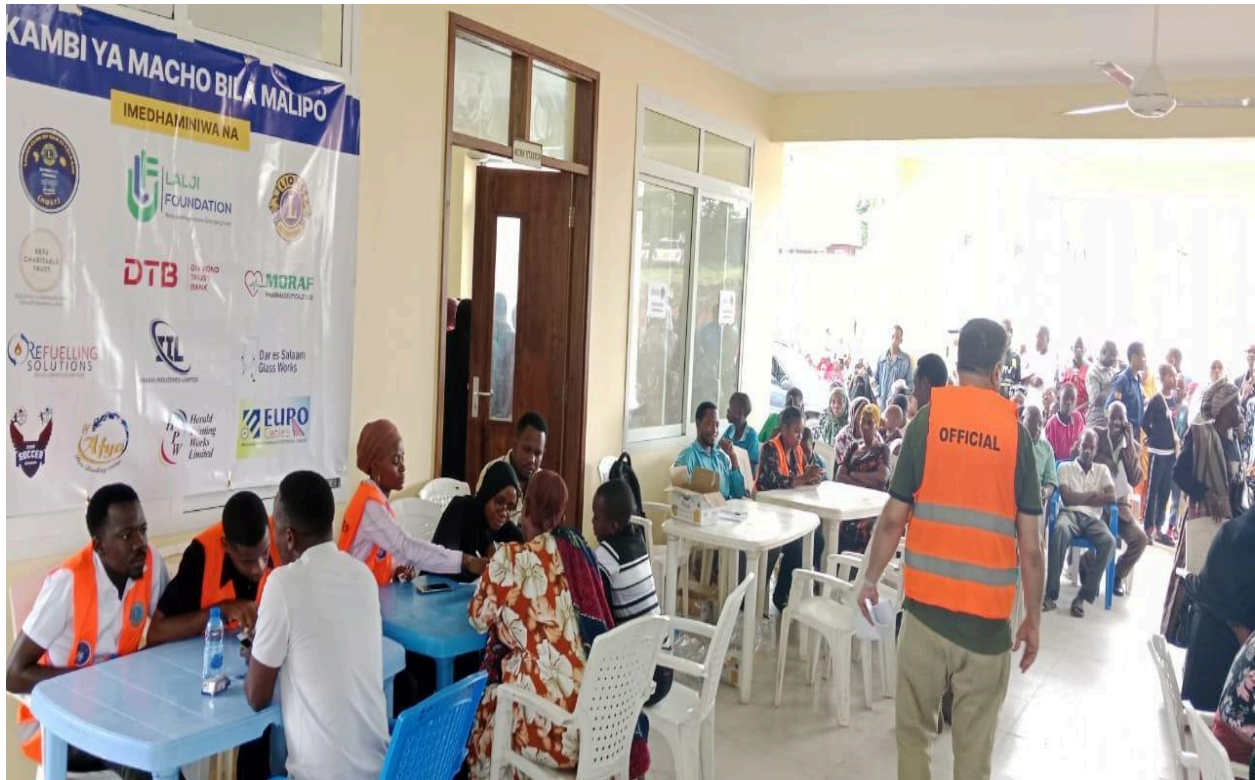
Registration on Medical Camp Vijibweni Hospital Kigamboni