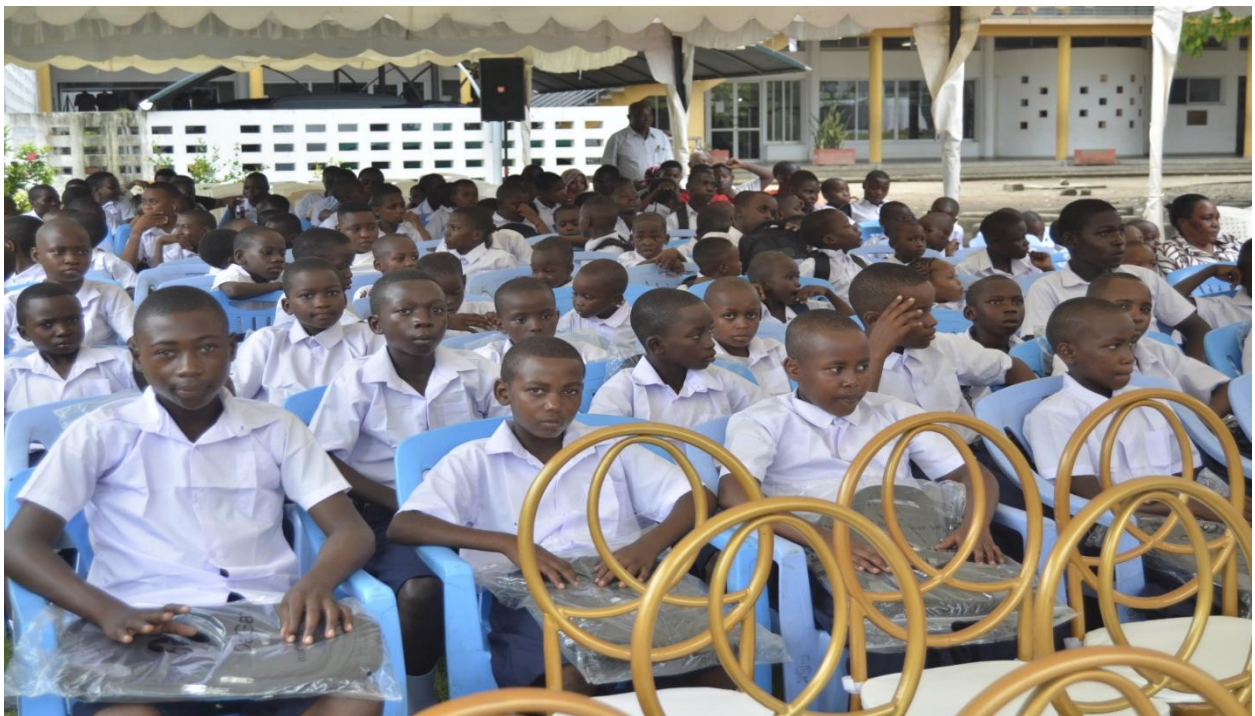
The orphans of different centres.