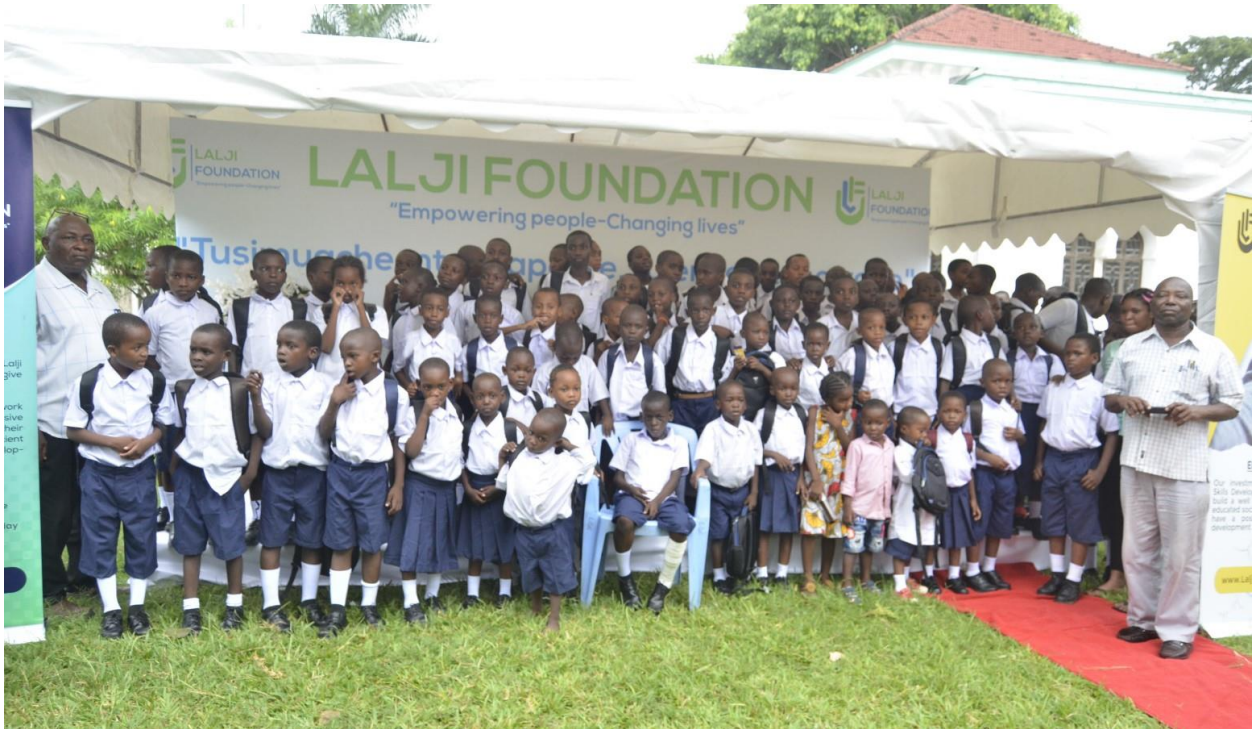
The orphans of the Yatima Group Trust Fund