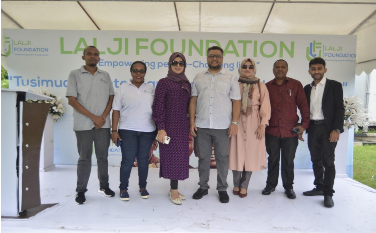
The Lalji Foundation members