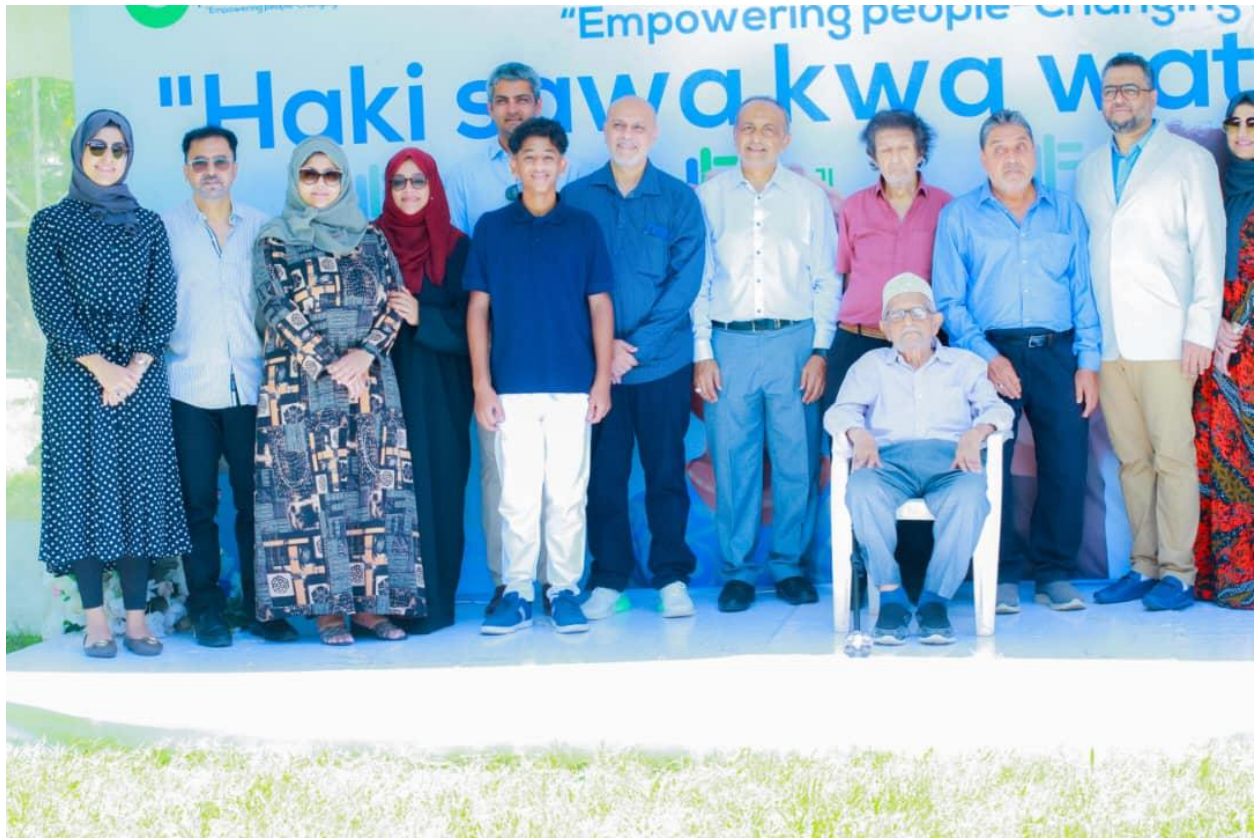
Lalji Foundation Family