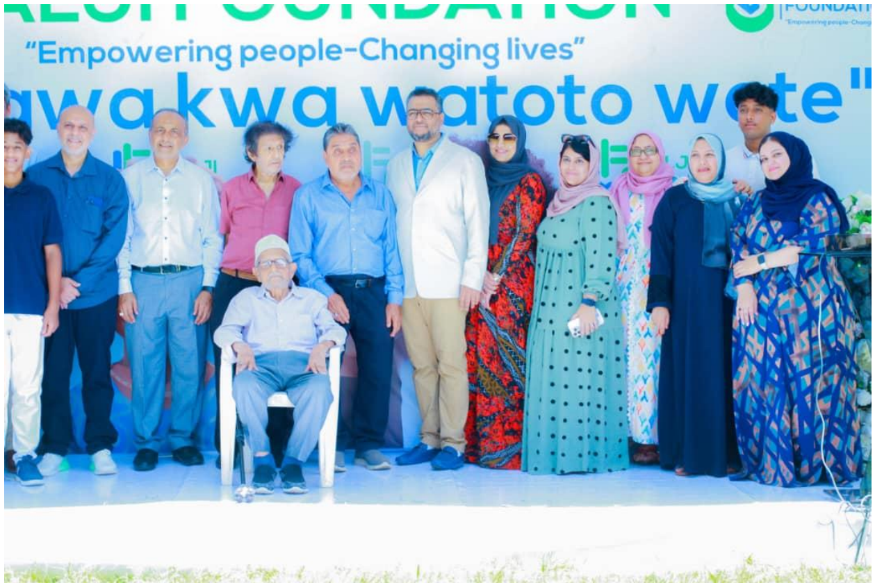
Lalji foundation Family