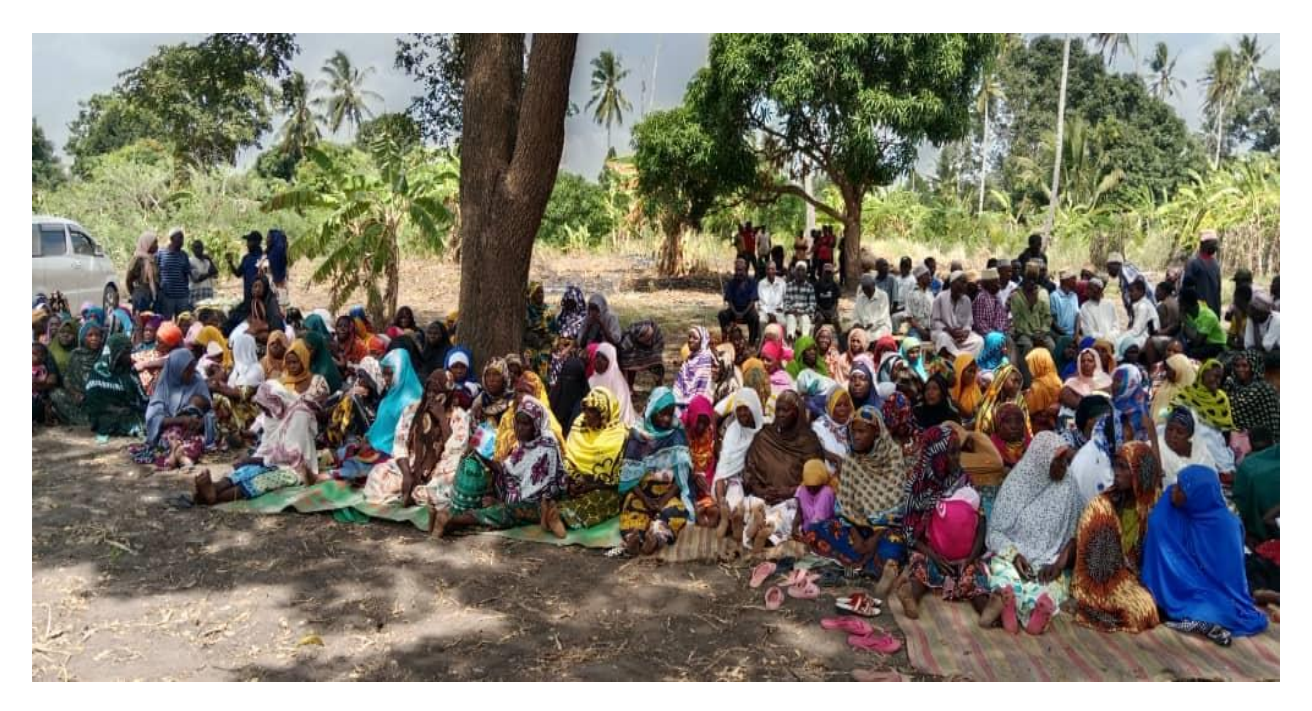
People of Mianzi village in Kisarawe District