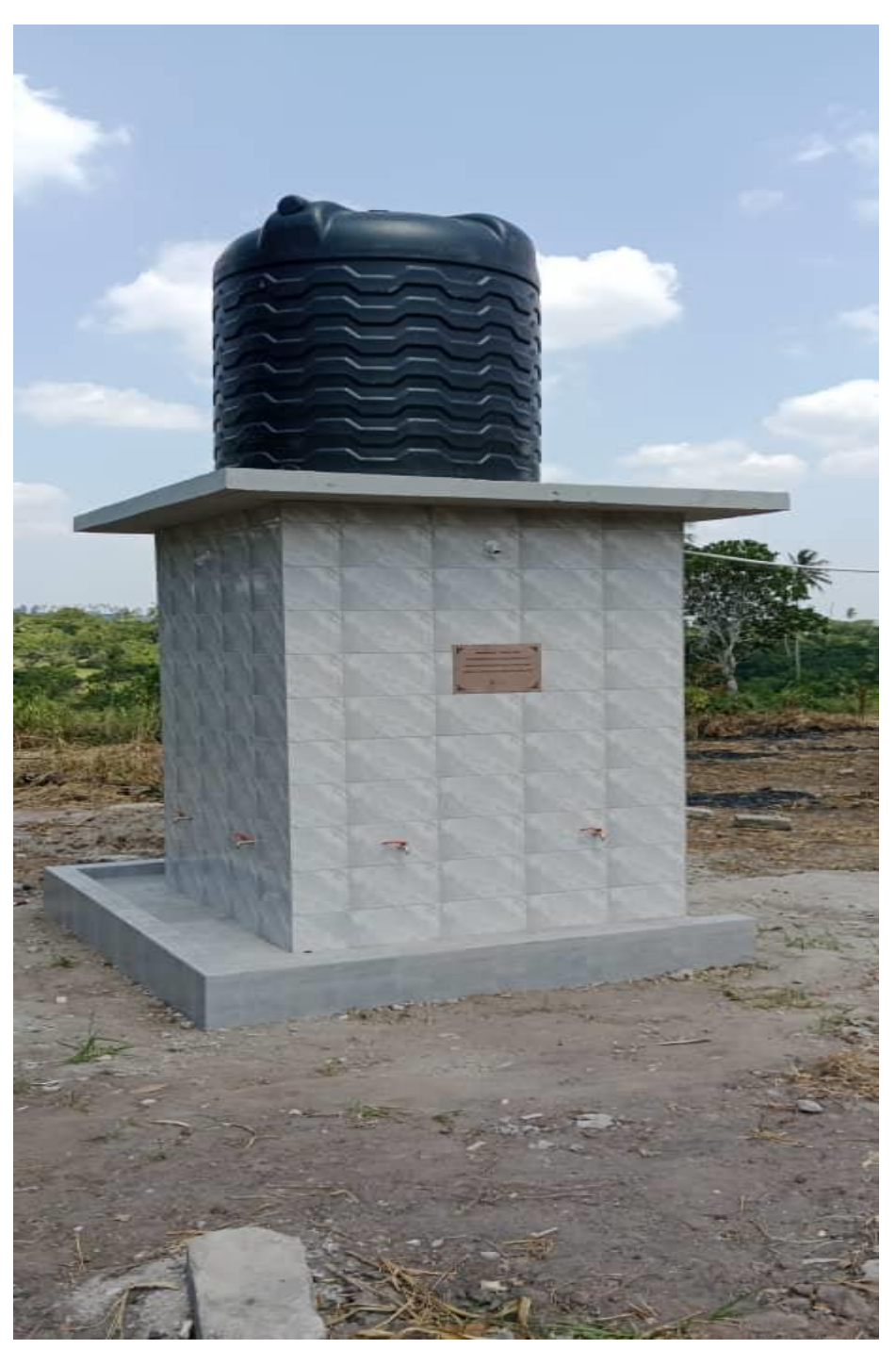
Borewell Kisarawe Mianzi village