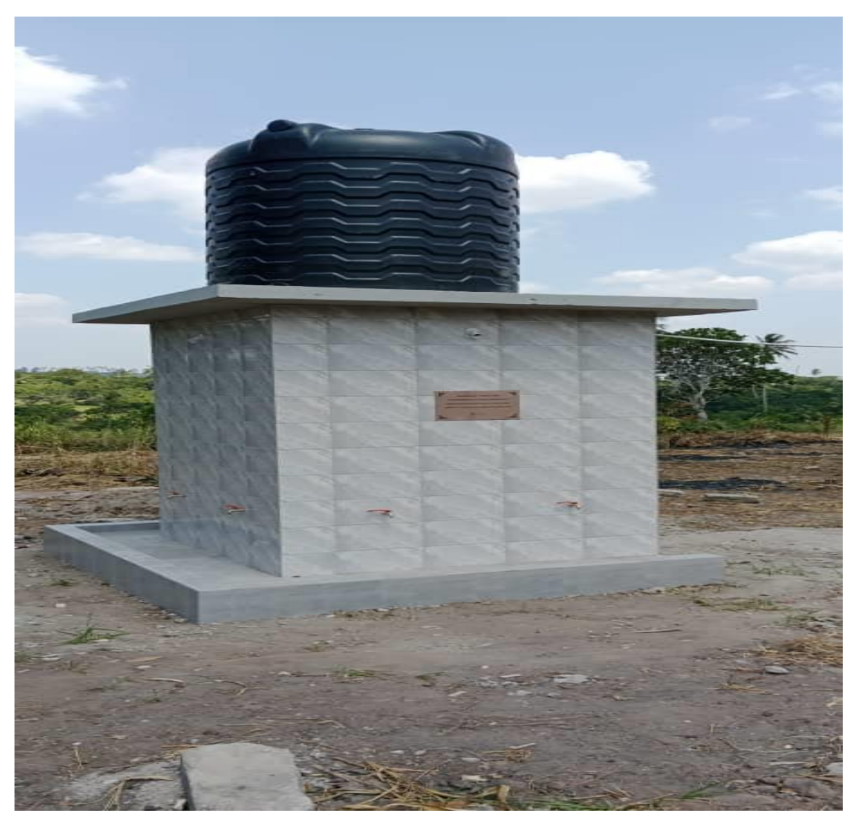
2<sup>ND</sup> MARCH 2025