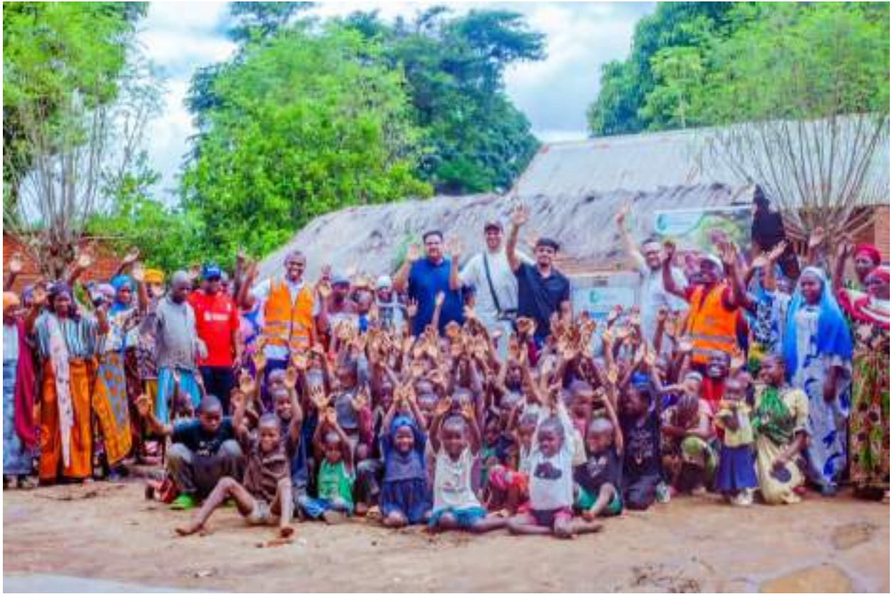
Lalji Foundation members and the village chairman, together with the beneficiaries.