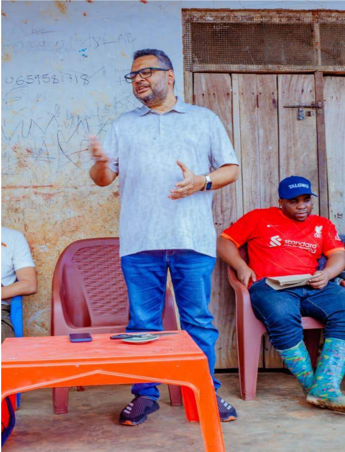
Chairman of Lalji Foundation